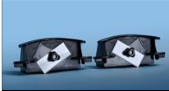
Vertical Cutter showing blade fitted for Left Hand and Right Hand Use respectively

When not in use always keep the Straight Cutter in its Foam Safety Guard